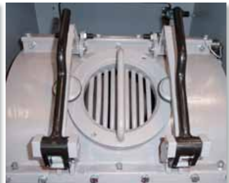
TTS 50 with emptying grid