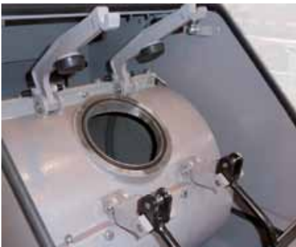
TTS 50 in the filling position with open closure

The drum mills are positioned for filling or emptying in inching operation or via an optional control with automatic positioning.