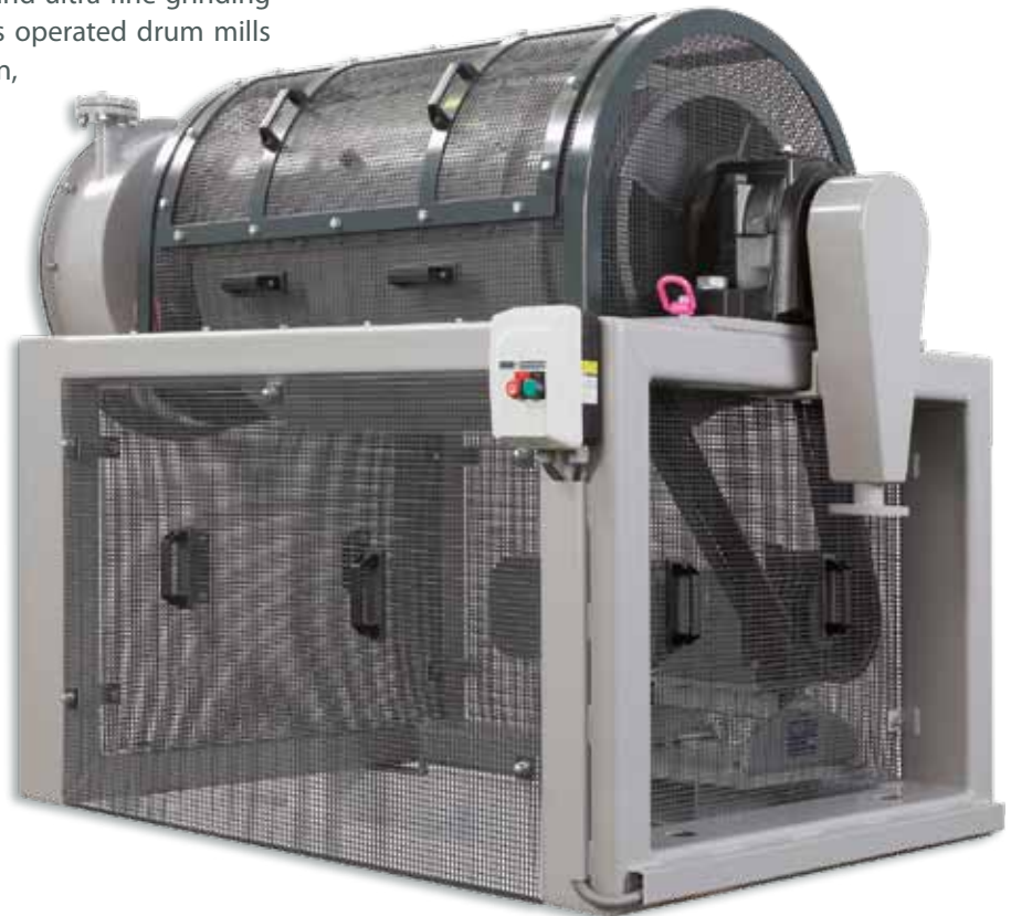
continuous TNS 200 K

The drum mills are used for fine and ultra-fine grinding of brittle materials. Discontinuous operated drum mills make, in addition to size reduction, homogenization of the material to be ground possible..