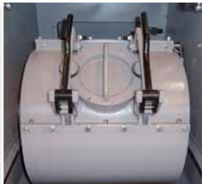
TTS 50 with sealing cover